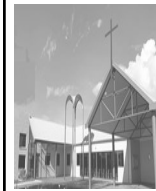
St. John the Baptist

St John the Baptist Church 62 Bowden Street, Glenorchy, 7010 P.O. Box 41, Glenorchy, 7010 St. Monica Church 67-69 Allunga Road Chigwell, 7011 Phone No: (03) 62726363 Email address: glenorchy@aohtas.org.au Parish Website: http://cdtas.org.au/glenorchy/Home.aspx The Parish has been entrusted to the Salesians of Don Bosco since 2000